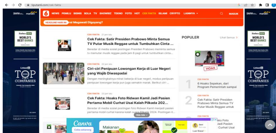
Figure 4. Screenshot of Liputan6.com's Cek Fata Page, December 24, 2024

be seen that the news on this channel consists of two types: summary news and fact-check news. Summary news makes a list like a week's hoaxes with a news structure in the form of a list, while fact-check news consists of an introduction, fact-finding, and conclusion. Examples of news titles on Cek Fakta Liputan6 are "6 Hoaxes of the Week, from Government Programs to Politics", "Cek Fakta: Hoax Photo of Ridwan Kamil Becomes the First Patient of Mobil Curhat After", and "Collection of Hoax Photos of the Week: Jokowi Becomes Golkar General Chair to Taylor Swift Eating Ice Cream in Front of Hungry Children". On the right side of the page there is a list of the 10 most popular news on the Cek Fakta Liputan6 channel.