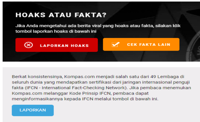
Figure 3. Report Section on the Individual Hoax News Page

Kompas.com also emphasized that it is one of 40 institutions that have received IFCN certification.