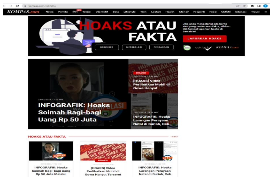
Figure 2. Screenshot of Kompas.com's Cek Fata Page, December 23, 2024