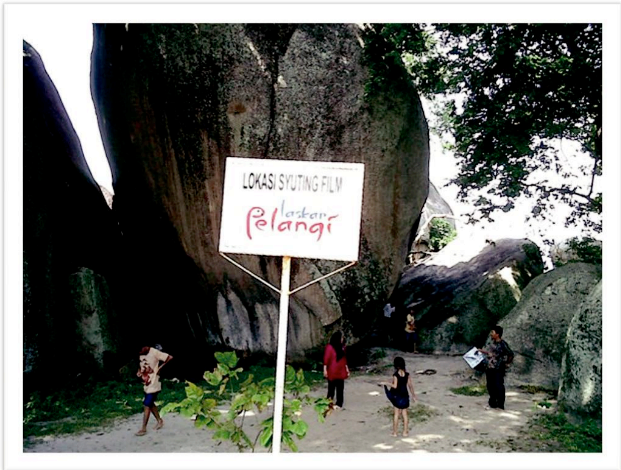
Figure 1: the sign “shooting location of Laskar Pelangi in Tanjung Tinggi, Belitung.

Figure.1 and figure.2 prove the existence of the Laskar Pelangi film sets and location becomes the tourist icon which draw tourist destination in the tourism location.