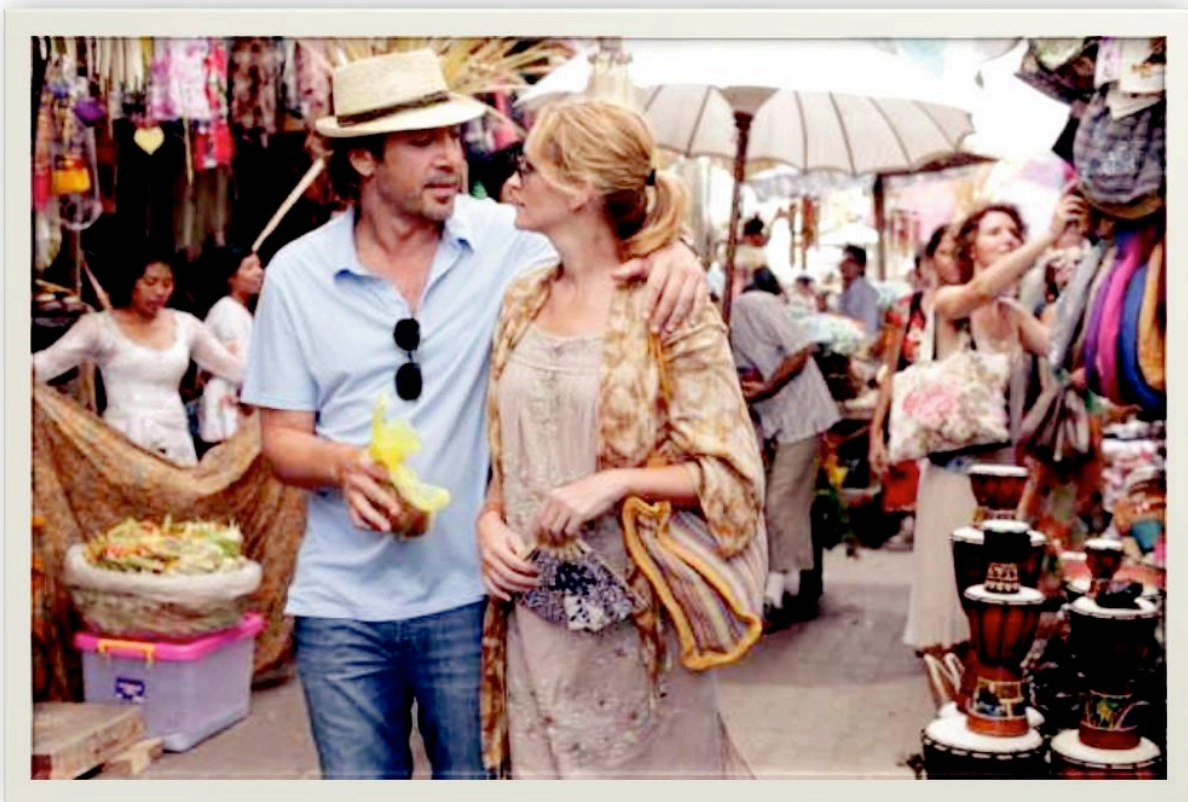
Figure 3: Julia Robert and Javier Bardem, doing the shooting of Eat Pray Love in a market, in Ubud, Bali