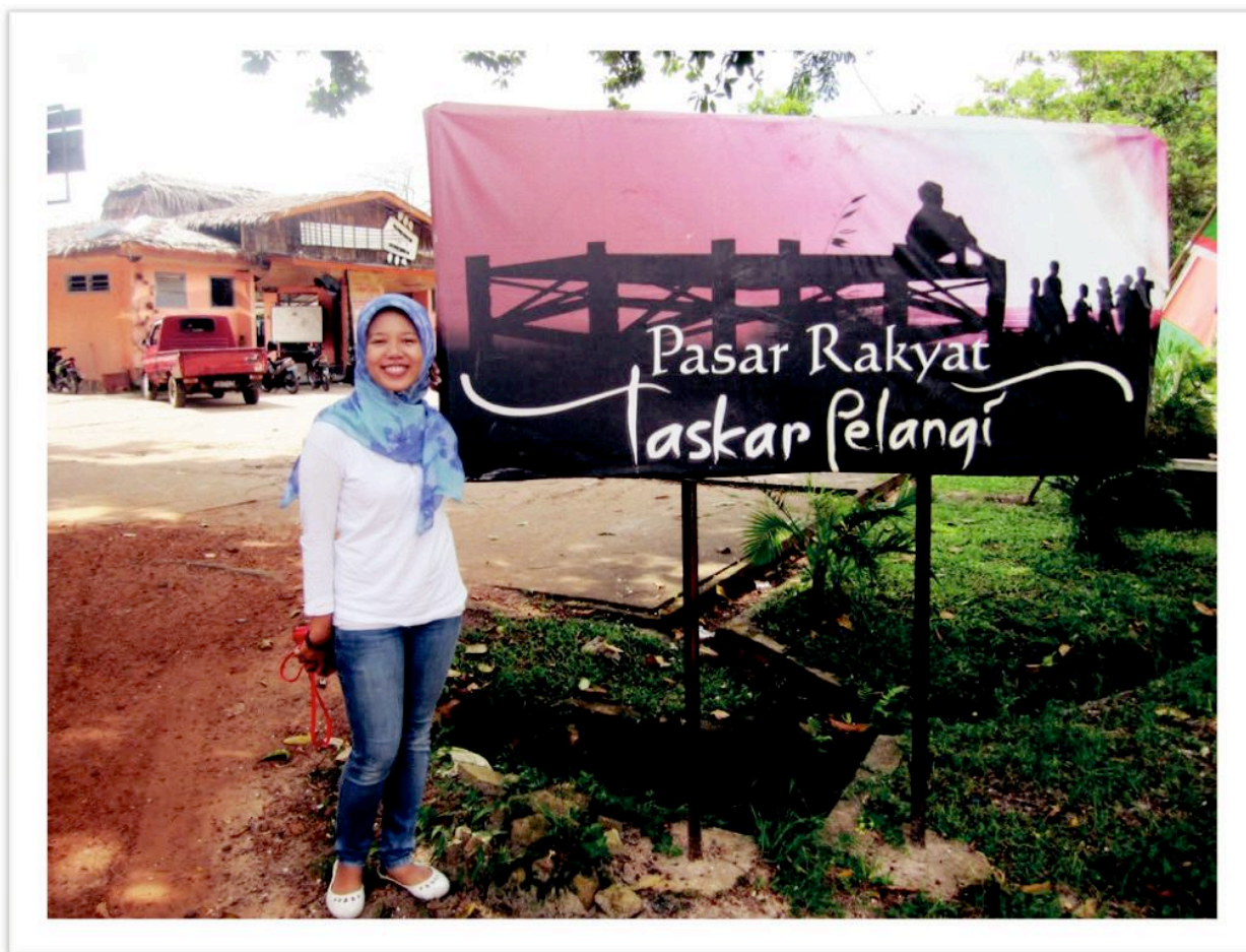
Figure 2: a local tourist posed in front of the sign: People Market of Laskar Pelangi.