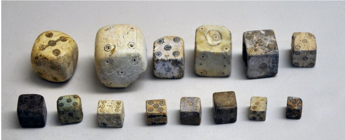
Figure 1. Roman-era dice

matter how slight or insignificant, where the outcome is uncertain or depends on chance or skill (Gamblers Anonymous, 2000; McCormick & Cohen, 2007). Led by casino's and slot machines, there are more and more types of gambling products that are widely spread with the success of their marketing campaign.