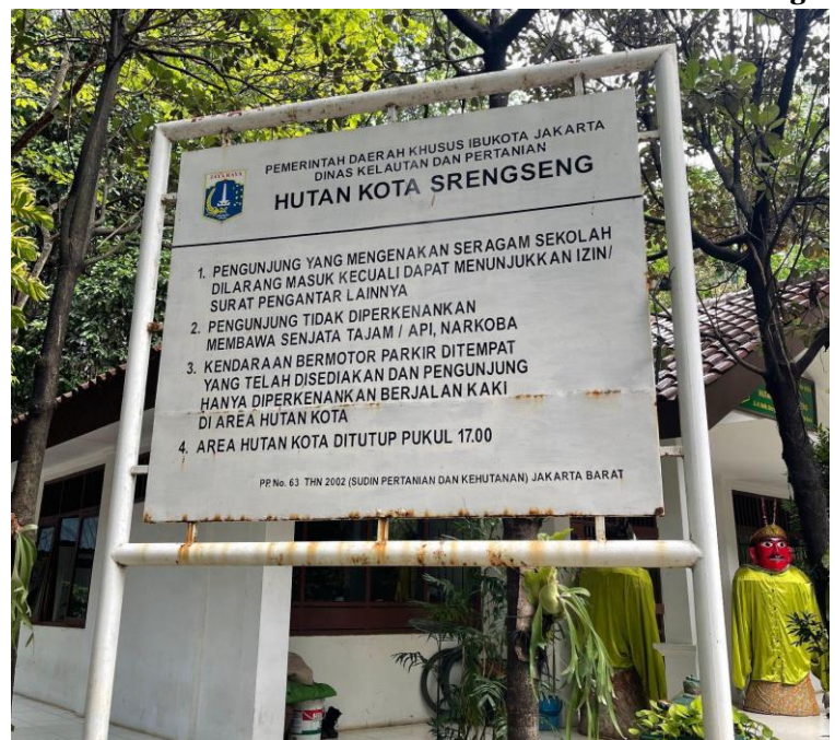
Figure 9. Information Board on Prohibition located next to the Management Office

uniforms. The maximum limit for being in the urban forest is 17.00 WIB, next to the manager's office. Then, there is also signage containing information on what activities can and cannot be done in Srengseng Urban Forest. In addition, around the lake area, there are information boards about prohibited activities and information banners prohibiting bathing or swimming.