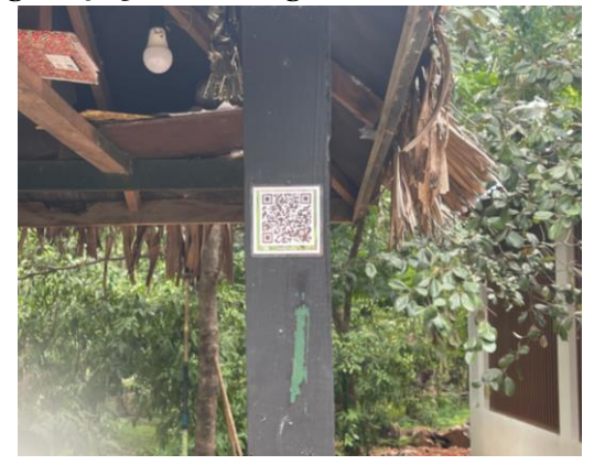
Figure 4. QR Code Usage for Guest Book Filling