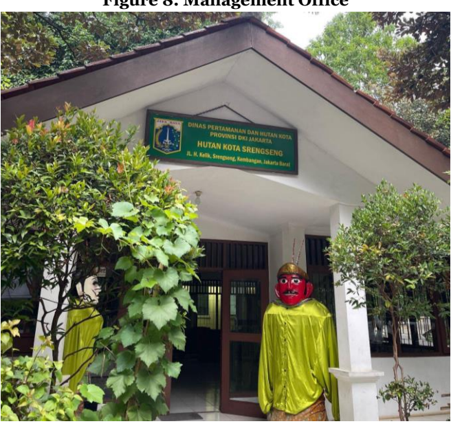
Figure 8. Management Office

This sign is used to provide visitors with information regarding the function and operating hours of a place. Referring to the informational sign, a sign explaining operating hours has yet to be available in Srengseng Urban Forest. This sign is an essential and fundamental aspect to be considered because it provides information for visitors regarding the functions and operating hours of a tourist spot. This signage should be located close to the entrance gate of the urban forest or around the entrance ticket purchase counter. However, this sign can be placed around the Srengseng Urban Forest management office due to the absence of an official entrance ticket counter.