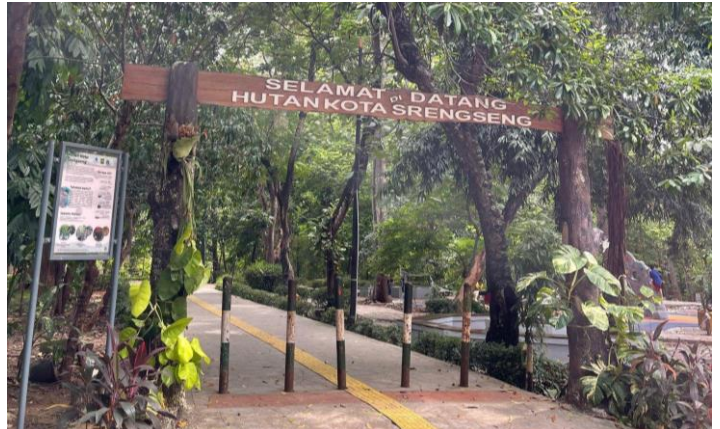
Figure 7. "Welcome to Srengseng Urban Forest" Sign at The Gate