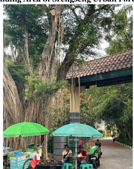
Figure 5. Surrounding Area of Srengseng Urban Forest Entrance Gate

Jakarta. Identification signs are generally installed around the entrance gate of the urban forest or 30 to 50 meters before the entrance gate.