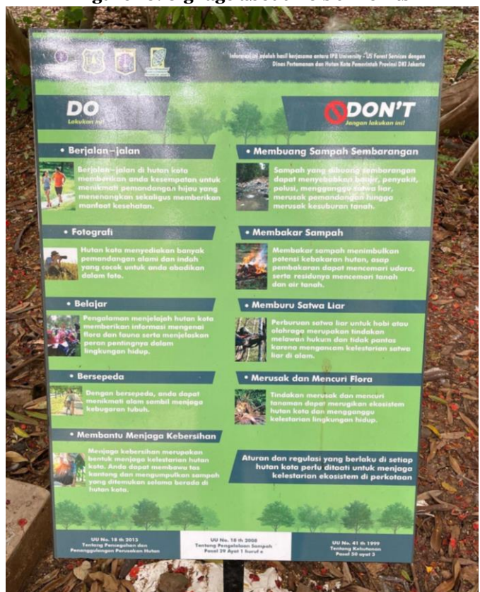
Figure 10. Signage about Do's & Don'ts