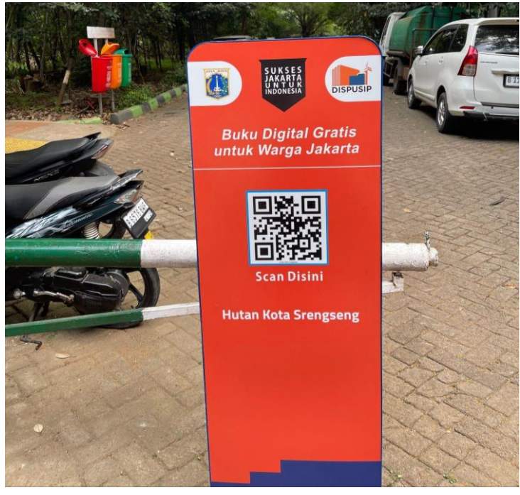
Figure 3. Free Digital Book Information Board