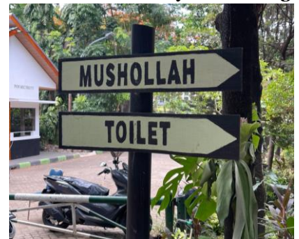
Figure 6. Toilet and Prayer Room Signage

This sign helps visitors find the direction or place they want to go. It should be easy to find and stand out with content that has a simple message. The sign is equipped with typography, symbols, and arrows to make navigation easier for visitors. In Srengseng Urban Forest, there is a directional sign indicating the direction to the toilet and prayer room, which are located next to the management office and not far before the entrance to the forest area.