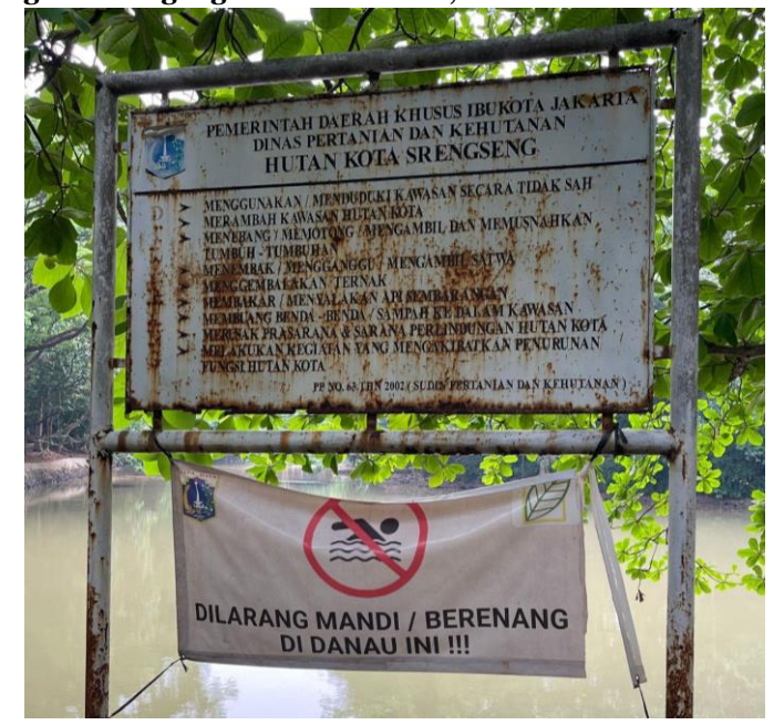
Figure 11. Signage on Prohibition, located around the Lake